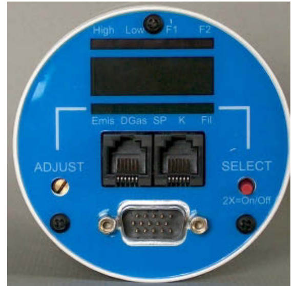
USER CONTROL INTERFACE