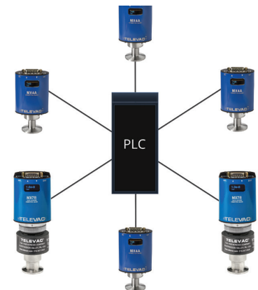
Figure 3. Star topology with a PLC, MX4As, and MX7Bs. Each active gauge is connected directly to the PLC.

PLCs almost always have an HMI (human machine interface) where the operator can control various functions of the furnace.