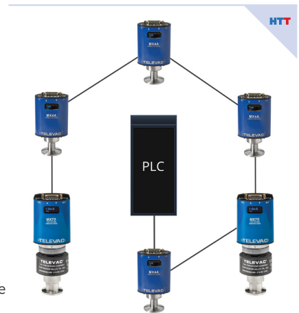
Figure 2. Ring topology with a PLC, MX4As, and MX7Bs. Each active gauge is connected to the previous active gauge.

So, you might be wondering, how does this apply to vacuum furnaces? All vacuum furnaces have a PLC (programmable logic controller) which is essentially the brain of the furnace. In North America, one of the most common types of PLCs is a Rockwell Automation® Allen-Bradley® PLC which has, you guessed it, EthernetIP capability!